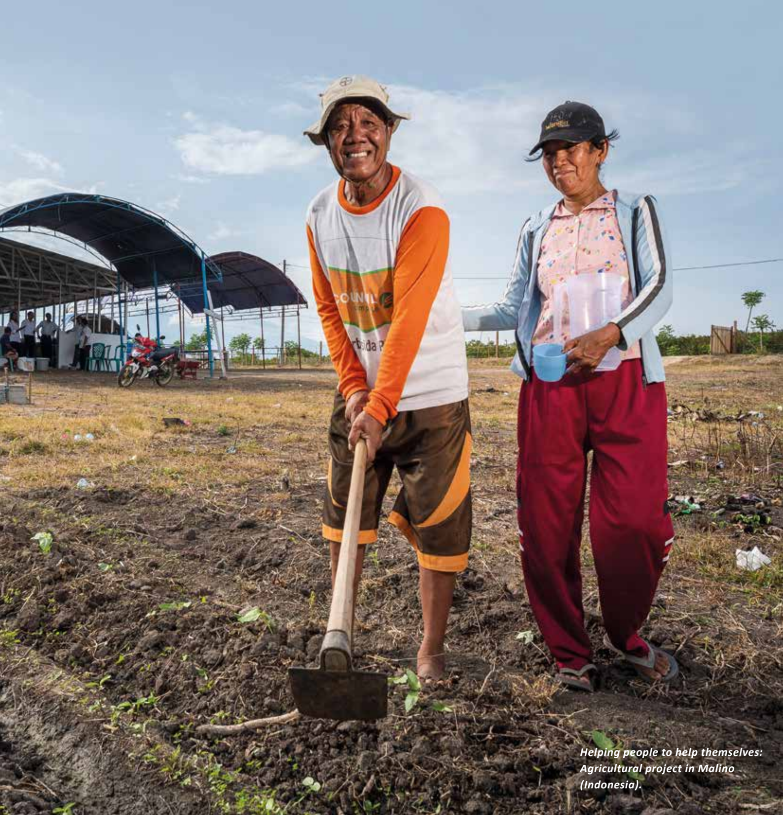
Helping people to help themselves: Agricultural project in Malino (Indonesia).