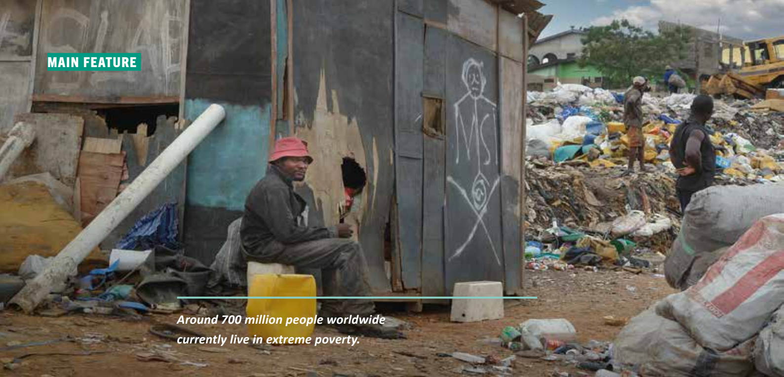
Around 700 million people worldwide currently live in extreme poverty.