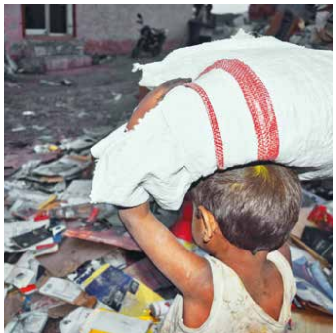
Child labor is one of the most serious consequences of poverty.