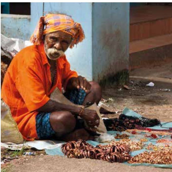
Poverty has many faces: Street vendor in Kerala (India).

Can poor people escape poverty if they live in such conditions? There is no patent remedy or a single universal theory for overcoming poverty, only the constant and unwavering call for all people to stop exploiting their fellow human beings and nature. Poverty can only be surmounted if we renounce oppression and join forces to build an alternative system that is more just. To quote Nelson Mandela again: “Overcoming poverty is not a gesture of charity. It is an act of justice.”